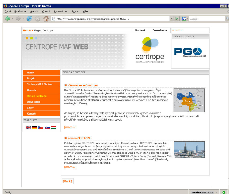
Fig. 2. The CentropeMAP website: http://www.centropemap.org/ .