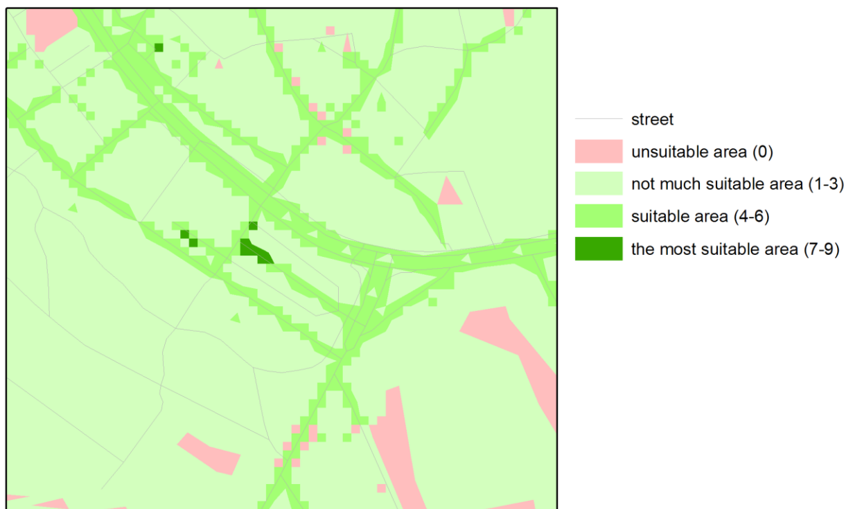
Fig. 1. Part of the raster of suitable areas