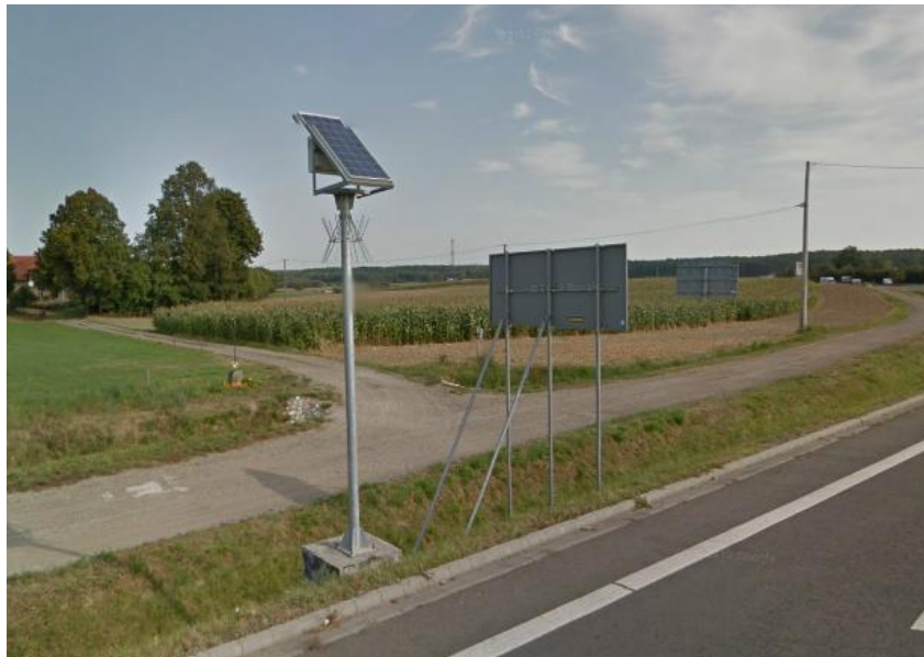
Fig. 2 Object identification in space on the national road No. 16: point 38 Gietrzwałd (126+250 km)

The precise location of the object was possible by using the Google Maps and Street View service.