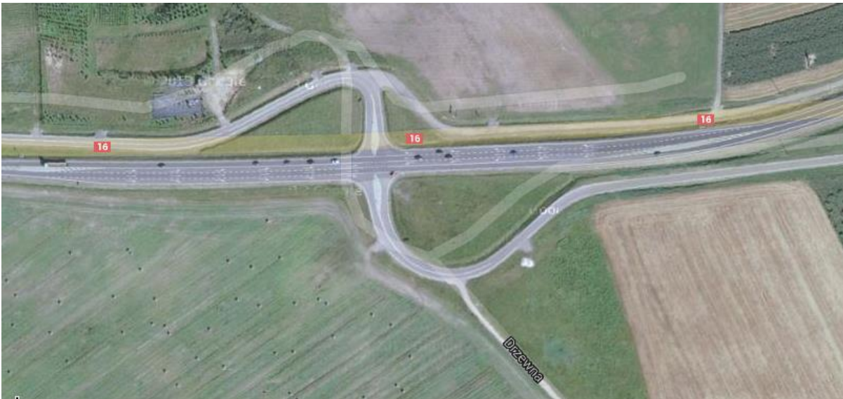
Fig. 1 Rough location of points on the national road No. 16 (Gietrzwałd)

The precise location of the object was possible by using the Google Maps and Street View service.