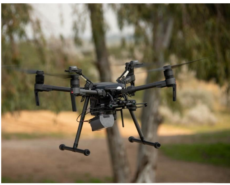
Fig. 1. Instruments used during the survey's campaigns

georeferencing and radiometric calibration of images. The advantages of using such sensors are to avoid using a calibration panel on the ground for the on-site image calibration while instead measuring simultaneously the incident and reflected sunlight for direct calibration. The specifications are reported in Table 1, while the in-flight set-up is showed in Fig. 1. During the two survey campaigns, about 20 flights were made, and around 150 GB of 2048 x 1536 pixels images have been acquired, with a mean ground sample distance (GSD) of about 2 cm. The information stored in the images is the RGB channels and the Red-W, the Red Edge and the Near InfraRed ones. A total of 27 Ground Control Points (GCPs) have been measured in both test sites with a multi-frequency, multi-constellation geodetic GNSS receiver in RTK mode.